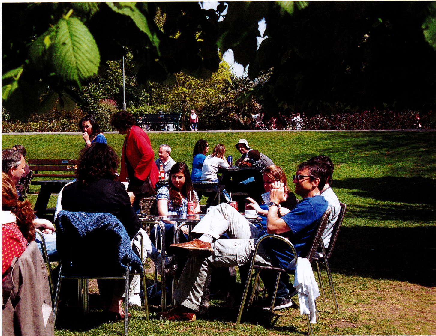
PET0711 Coke in park